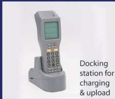
Docking station for charging & upload